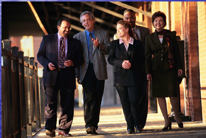
Visionary Mentoring RadSciences Group